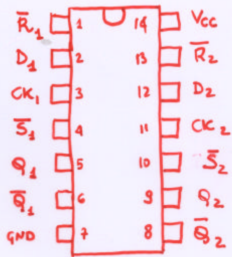
7474 dual D-type positive-edge-triggered flip-flops